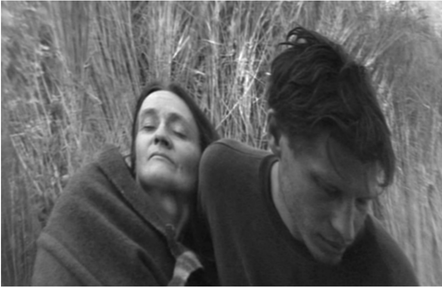
Still from Mother and Son .

painting 32 by working on the camera lens with brushes, paint and other tools of painting as he himself describes in his comments on Mother and Son :