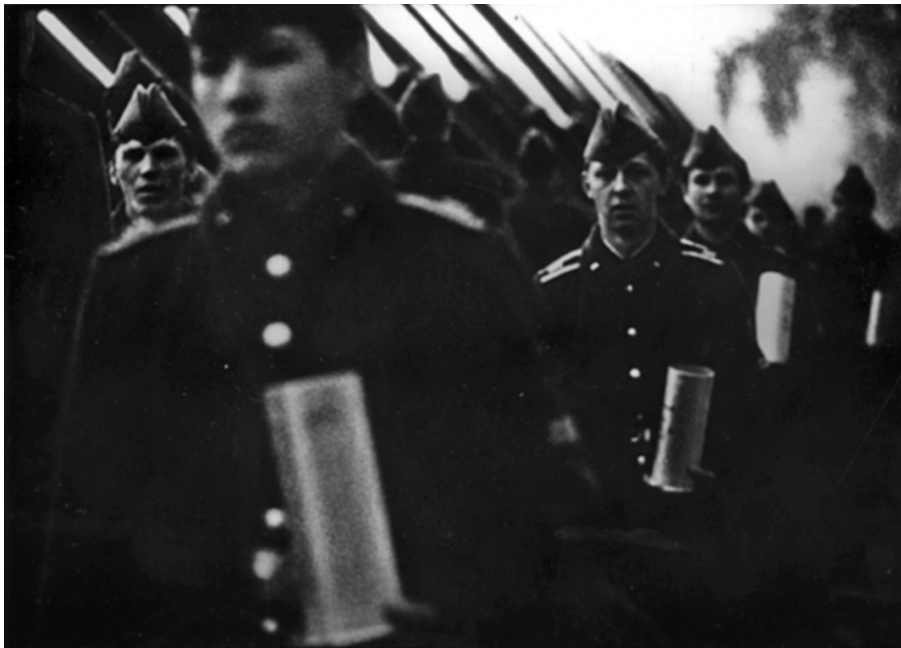
Still from Evening Sacrifice .

The isolation of the festive day chronotope from any kind of history reveals the physical dimension of actions beyond their ideological meaning in social ritual. Two different collective bodies are juxtaposed: the mechanical movements of soldiers and a crowd driven by instincts that is not – as it would be in keeping with the